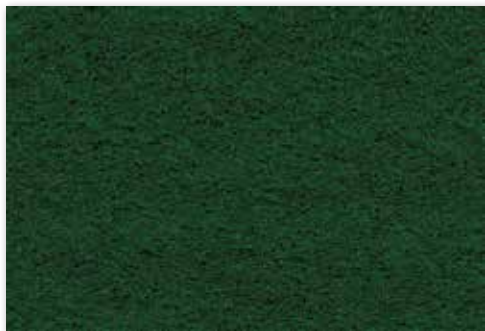
466 Kelly Green