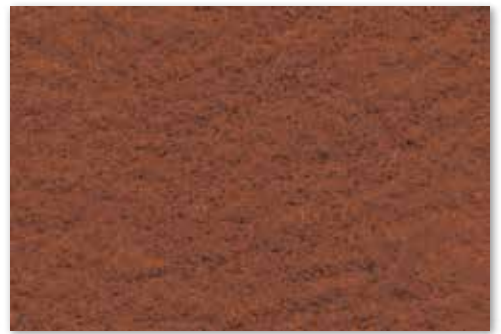
K23 Copper Canyon