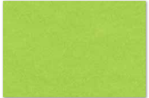
4H7 Neon Green