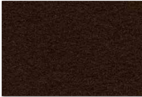
851 Cocoa Brown