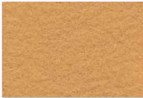
884 Cashmere Tan