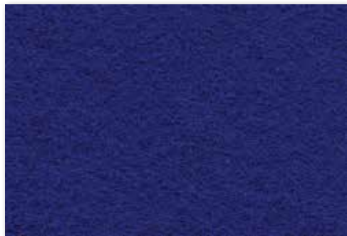
678 Royal Blue