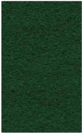
466 Kelly Green*