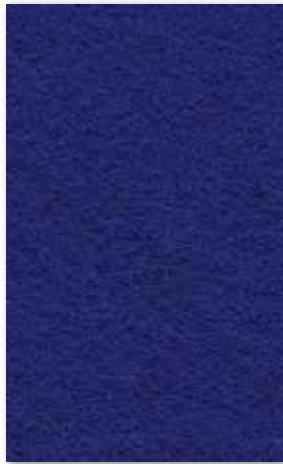
678 Royal Blue*