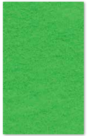
458 Apple Green