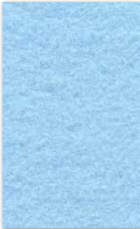
660 Baby Blue