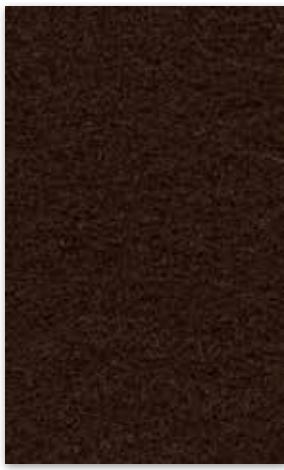
851 Cocoa Brown