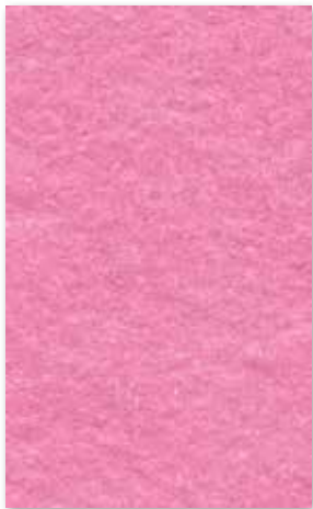
020 Candy Pink