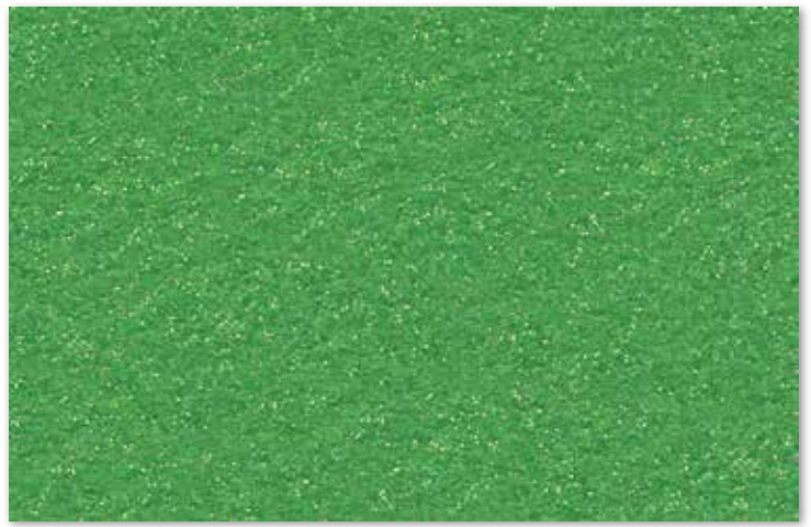
458 Apple Green